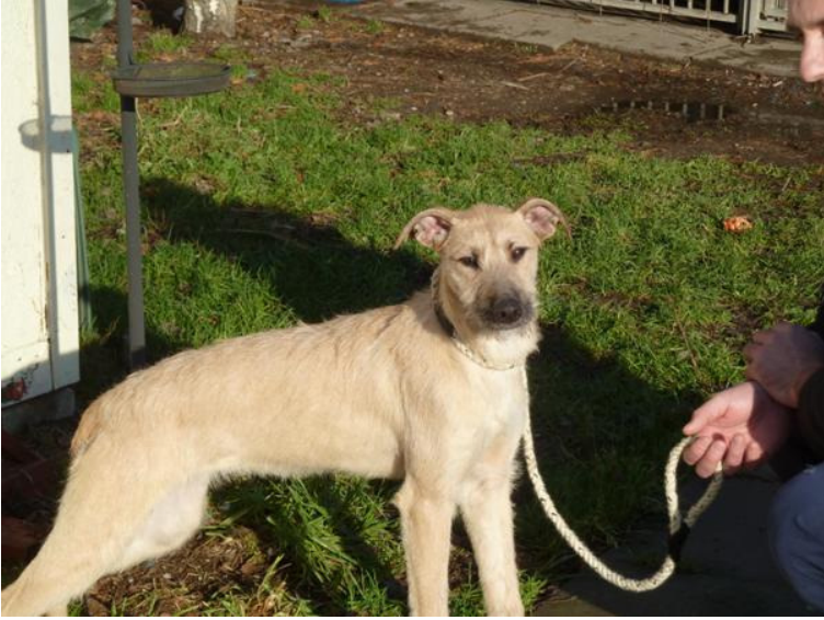
After a days training.