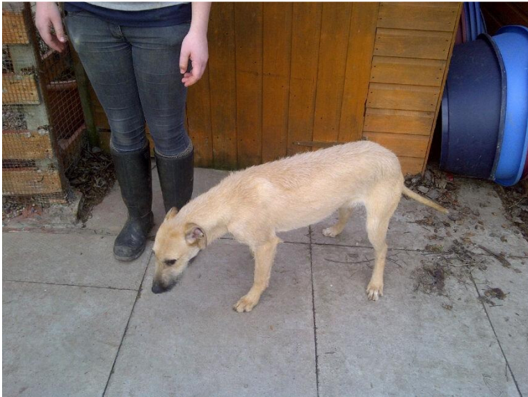
Katy when she first arrived.