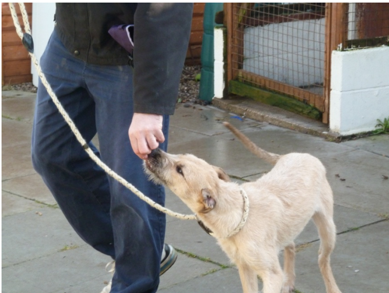
Having lead training.