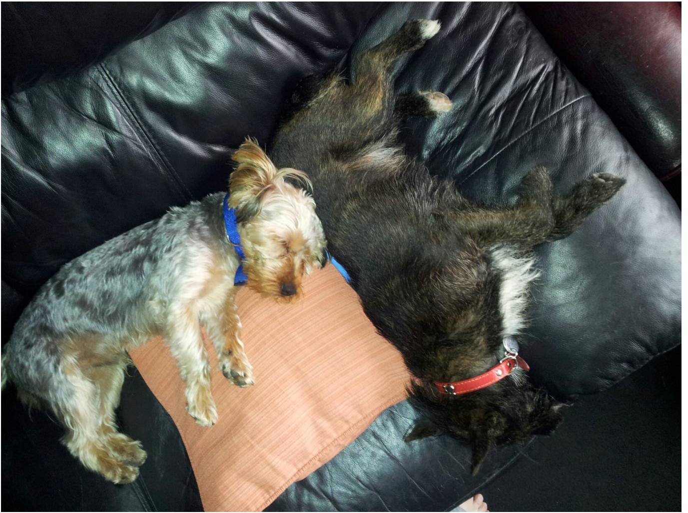
Toby and Billy having a snooze together 😊